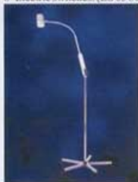
Examiantion lamp with flexible arm on five castor stand