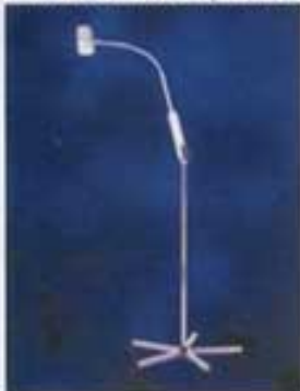
Examination lamp with flexible arm on five castor stand