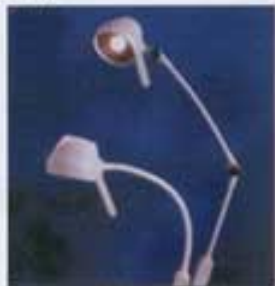
Rail mounted examination lamp with adjustable arm. (YA 01 0001)